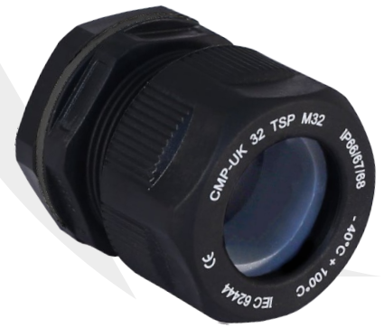
shown in black with standard seal and locknut