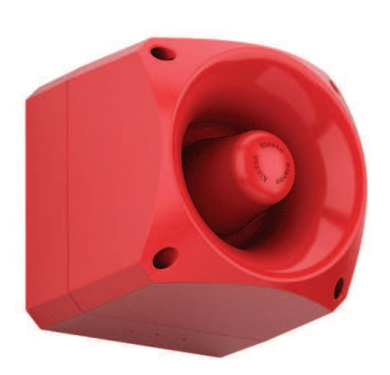
Applications - Conveyors; process control alarm; cranes; moving machinery; general signalling