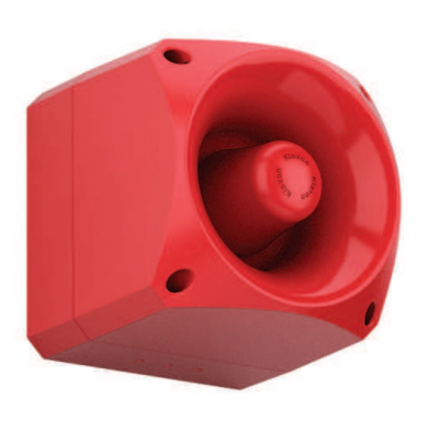
Applications - Fire alarm; conveyors; process control alarm; cranes; moving machinery; general signalling